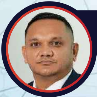
The Honourable Vickram Bharrat Minister of Natural Resources Co-operative Republic of Guyana