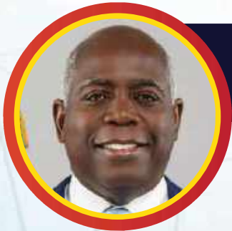
Dr. Carla Barnett Secretary General CARICOM