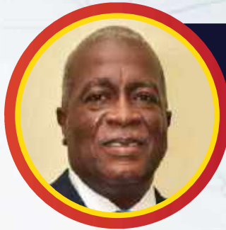
The Honourable, Brigadier (Ret'd) Mark Anthony Phillips Prime Minister Co-operative Republic of Guyana