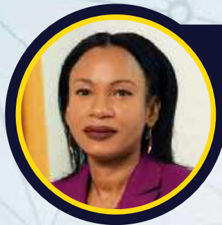
The Honourable Oneidge Walrond Minister of Tourism, Industry and Commerce Co-operative Republic of Guyana