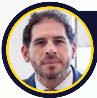
Mauricio Bejarano Vice Minister, Mines and Energy Republic of Paraguay