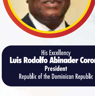
His Excellency Luis Rodolfo Abinader Corona President Republic of the Dominican Republic