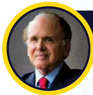
Professor Daniel Yergin Vice Chairman S&P Global