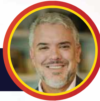
The Honourable Joseph L. F. Hamilton Minister of Labour Co-operative Republic of Guyana