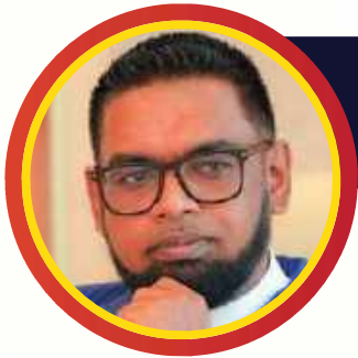
His Excellency Dr. Mohamed Irfaan Ali President Co-operative Republic of Guyana