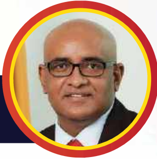
The Honourable Dr. Bharat Jagdeo Vice President Co-operative Republic of Guyana